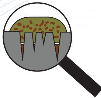
Wetting with 'classic' cleaning products