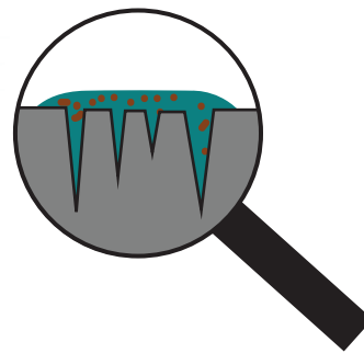
Super wetting effect